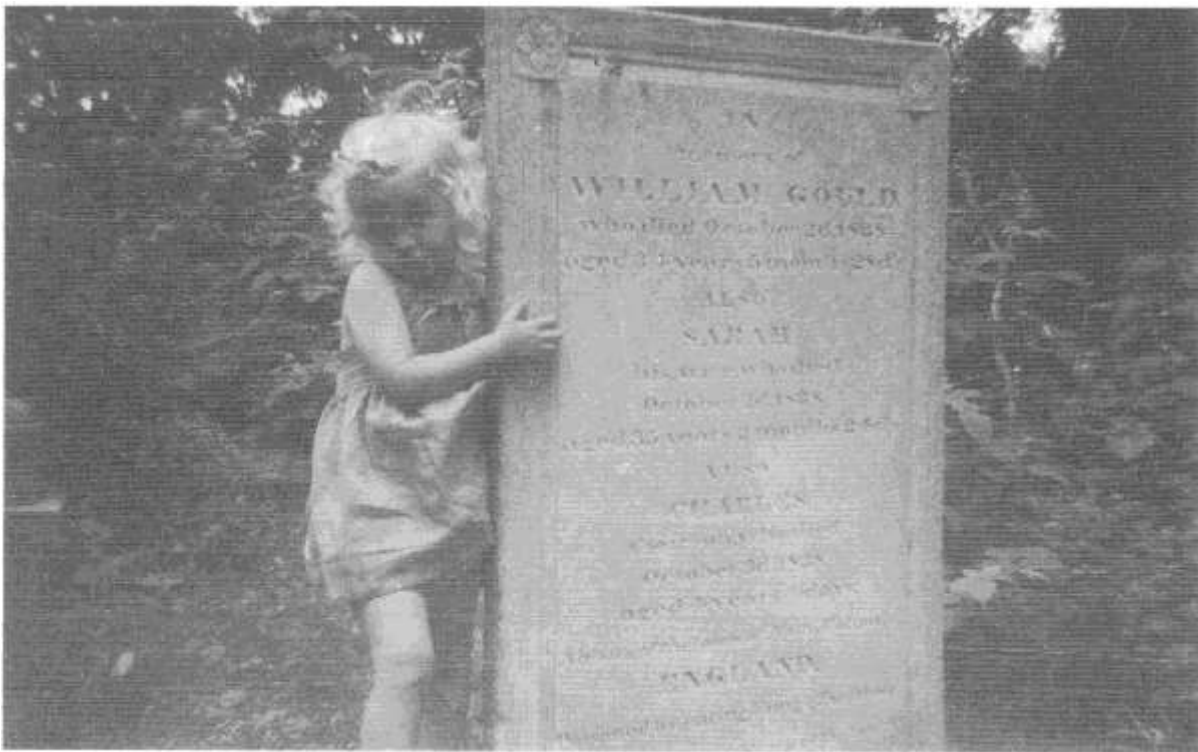
The "toadstool" stone, photographed c. 1955

The Verplanck family seems to have favored memorials shaped like a Doric column without the capital. There is a tradition that when some graves were dug in the nineteenth century, bones and fragments of blankets were discovered. This would indicate that there were some burials from the war period that were either unmarked or had markers that did not survive.