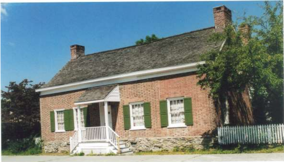
The Glebe House Poughkeepsie, New York