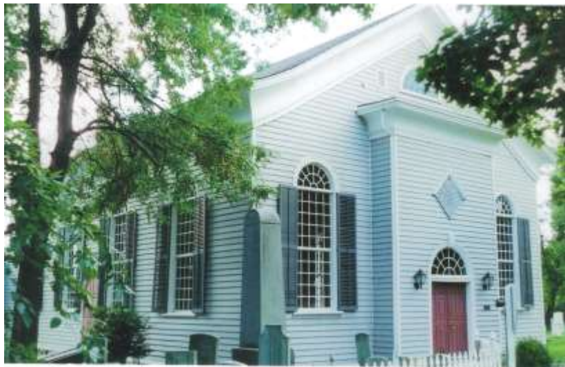
Trinity Church 1994

As this is being written, the church is in the process of acquiring some land to alleviate the disastrous shortage of parking space.