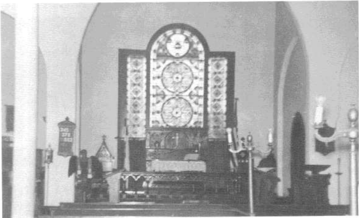
Church Interior c. 1930